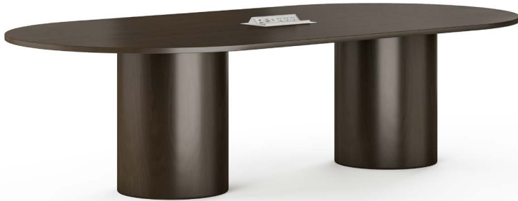
Cylinder Conference table

Cylinder tables are a perfect solution to any office environment. Offering power/ data options allowing you to collaborate, interact, and share information — table solutions made simple.