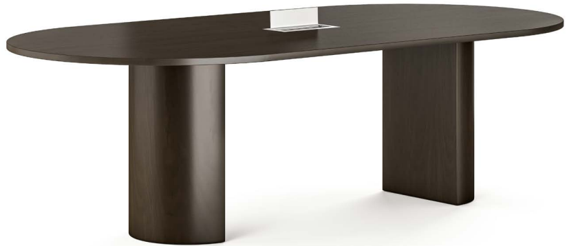
Half-Cylinder Conference table

Cylinder tables are a perfect solution to any office environment. Offering power/ data options allowing you to collaborate, interact, and share information — table solutions made simple.