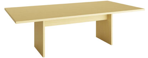
Thin Panel Base - 1-1/4" thick

Panel Bases conference tables are available in other shapes and sizes