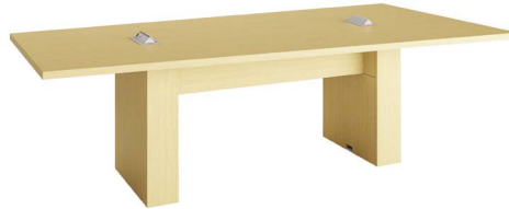
Thick Panel Base - 6" thick Access panel in each base for wire management