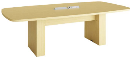
Thick Panel Base - 6" thick Access panel in each base for wire management