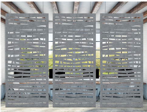
Ceiling suspension with floor anchors shown in each application.

3/8" or 1/2" Acoustical / Tackable Material | 23 Colors | Satin Silver Finish Hardware