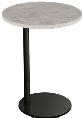
▲ C3 | FIXED HEIGHT

Compact by design yet big on function, the Commuter Series serves to create flexible workspaces or provide convenience as a side table. Thin low profile bases with slender columns allow for close contact & ample surfaces accommodate laptops, tablets, notebooks & more.