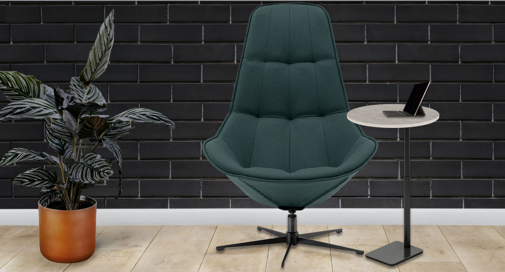
▲ C2 | ADJUSTABLE HEIGHT

LAPTOP / OCCASIONAL TABLES | 5 STYLES | FIXED & ADJUSTABLE HEIGHT OPTIONS