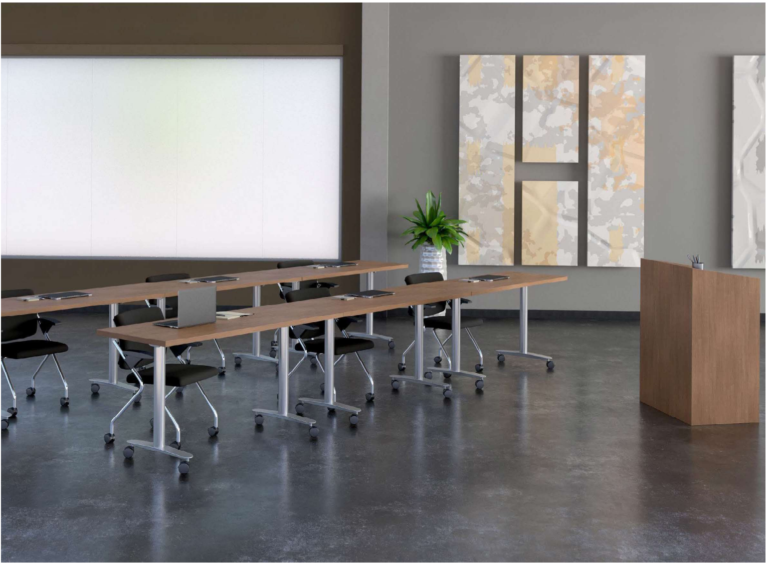
Alpine Training Tables with casters and Freestanding Lectern.