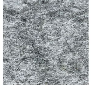
SG04 - SILVER GRAY