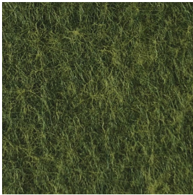
MG10 - MOSS GREEN