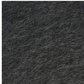
BG07 - BOLD GRAY