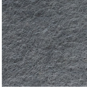
EG11 - ELEPHANT GRAY