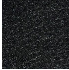
PB09 - PURE BLACK