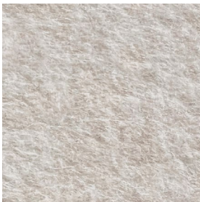
LB01 - LIGHT BEIGE