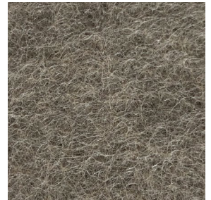
DS10 - DESERT SAND