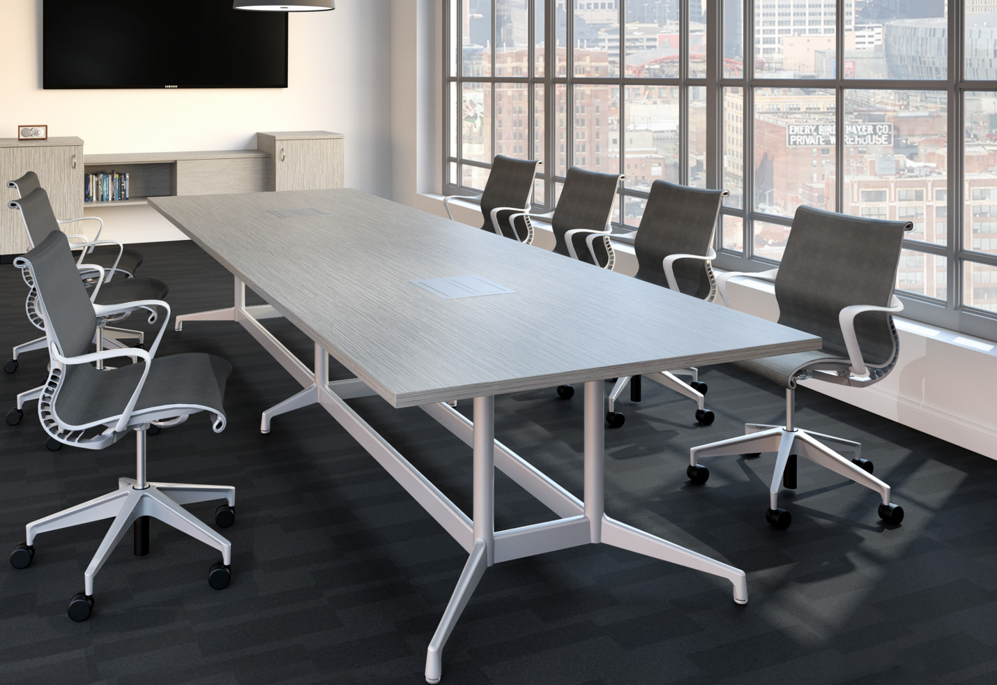
TABLE MODEL# SLXL48144SQ w/2 OPTIONAL PPD30'S & GREENIDA ELEMENTS FROM OUR 3600 SERIES.

The aesthetic framework of this table series exhibits a distinct elevated effect.